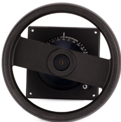
FOLLOW-UP HAND WHEEL

As with all Northrop Grumman Sperry Marine systems and products, all your NAVIGUIDE 4000 components will be supported by one of the world's most extensive worldwide service networks, with help available around the clock, 24 hours a day, 365 days a year. Our global service network provides prompt shipboard maintenance and repair services in every major seaport in the world. We also offer comprehensive maintenance contracts, as well as support for all products for at least ten years after any is discontinued, so providing continuing peace of mind to all our customers.