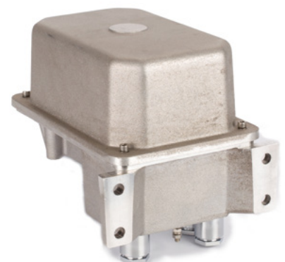
RUDDER ANGLE FEEDBACK UNIT