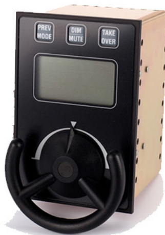
FOLLOW-UP MINI WHEEL & DISPLAY